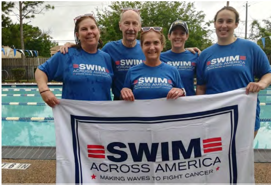
MACA SWIMMERS CELEBRATE AFTER THE MAC AGAINST CANCER SWIM ON APRIL 13