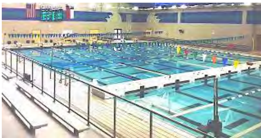
Galena Park ISD Natatorium – Home of North Channel Aquatics Masters